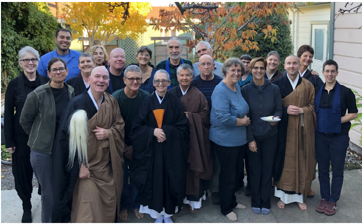
After Fall Practice Period Dharma Inquiry Ceremony