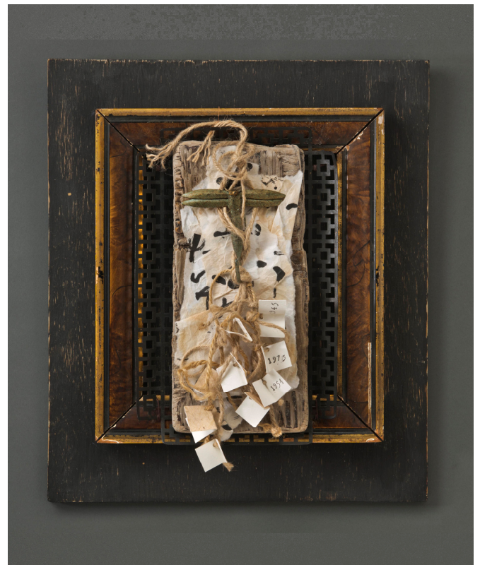
The Great Matter by Laurie McCann

Today, you watch white-flaked crystals burst into mirrors of perfect sunlight, listen for the ruby-crowned kinglet feel the weight of so much falling away.